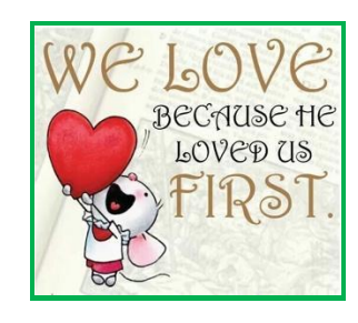
Dear Lord – there are times when I don't love myself. Help me to be less critical of myself and assure me that You always love me. Amen